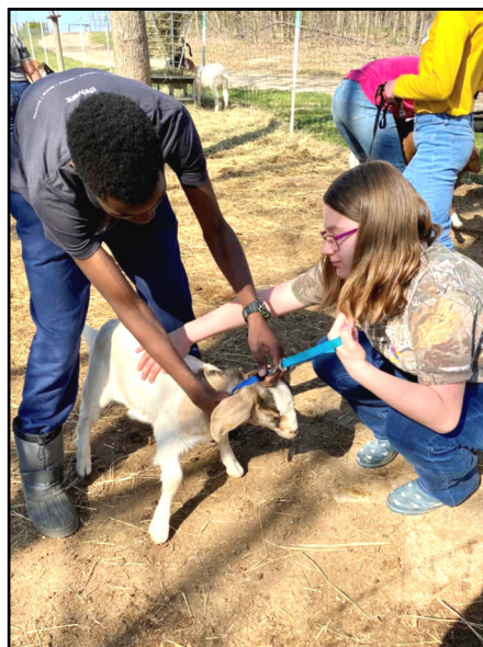
Raising & training their market goats all year for summer 4-H fair showing competition & auction sale.