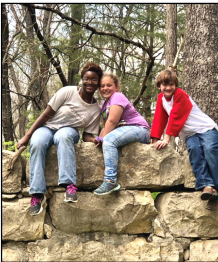
Hiking through the woods can bring some fun surprises ... an old rock barn foundation from the 1800s era!

Time. It was a wonderful opportunity for them to learn and practice various aspects of photography!