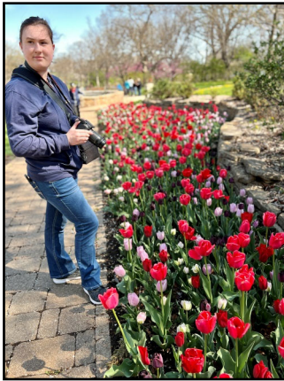
Most of our kids attended a fantastic 4-H photography workshop held at Lake Shawnee in Topeka during Tulip

Time. It was a wonderful opportunity for them to learn and practice various aspects of photography!