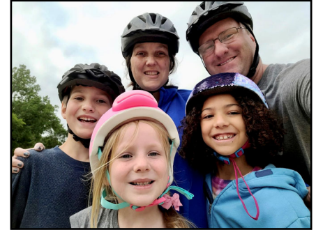
Time for a 6-mile bike ride across the levy trails near Lawrence! These kids rock!!