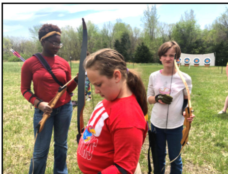
4-H archery lessons have begun! Several of our kids are participating in learning this skilled sport.