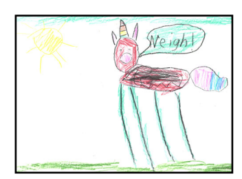
"Unicorn" by Emmalyn, 6 She said, "I like Unicorns and wanted to draw one!"

"Tree Delivery" by Mae, 13 She likes vintage trucks!