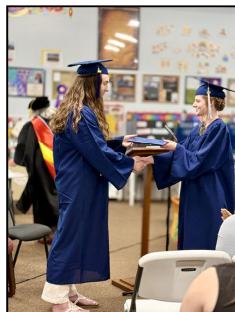
wonderful gathering of family and dear friends from church and the community, as well as former teachers, for her graduation ceremony & celebration! There was

an abundance of delicious food and treats to share, and a sentimental slideshow of photos from over the years, along with her official College Prep High School Diploma! She expressed deepest gratitude for each person who helped her reach her goal of a 4.0 GPA while also learning to